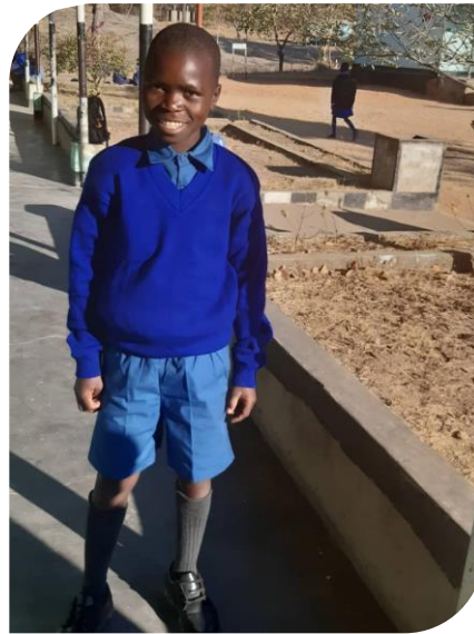
Learner's school uniform: before (left) and after (right) receiving sponsorship from ZimCross.